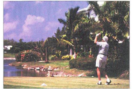
Britannia Golf Course