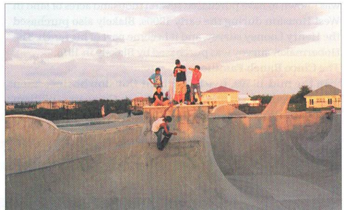
Black Pearl Skate Park