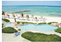
The Reef Resort's accommodations range from studios to two-bedroom suites, all with kitchens and patios facing the sea so when you walk out your door, you're right on the beach. On Page B1: Rum Point Beach, one of the most popular beaches on the East End of Grand Cayman.

Our other favorite is Over the Edge, an open-air rustic restaurant with a busy bar and a big patio perched over the sea.