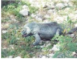
The Iguana Sanctuary.

George Town is an exciting city with plenty of activities, upscale eateries,